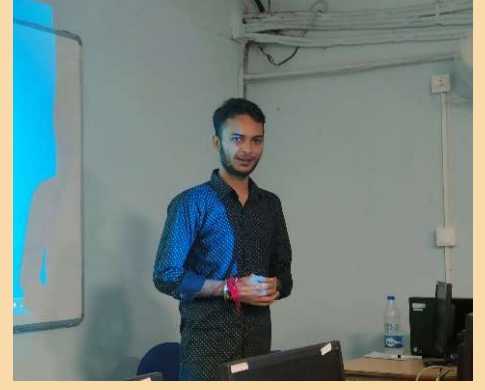
Teacher's Day Celebrations