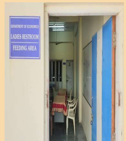
Ladies Rest Room Feeding Area