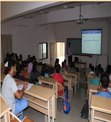
Spacious Classrooms With DLP Projectors

The Department of Library and Information Science has a dedicated Ladies' Rest room to cater to over 90 percent of the girls' students in the department. The furnished room has the facility like cradle for new born, dressing table and two beds for any health emergencies. This apart it has also feeding area for nursing mothers. The department has also purchased a sanitary pad vending machine apart from incinerator to burn the used pads. Recently the department could purchase 70 desktops for a newly refurbished computer laboratory in the department. The department also houses a beautiful seminar hall catering to an audience of around 150 persons. The hall is one of the most sought after one on the campus for various academic and cultural purposes.