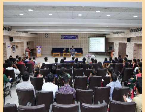
Six Days Workshop on Research Methodology