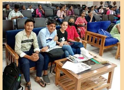
Best out of Waste Competition