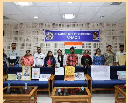
National Librarian Day