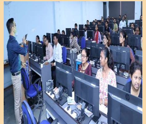
One Day Workshop On Reference Management Software