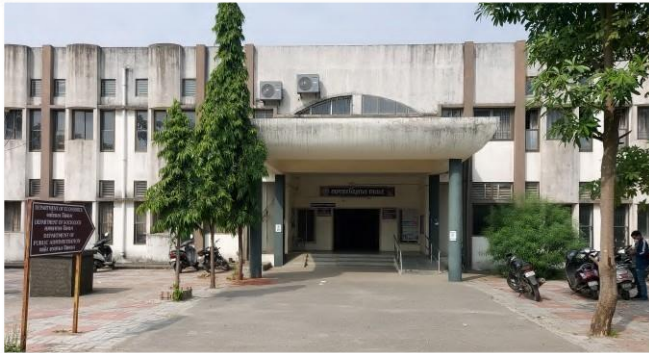
Department Main Building