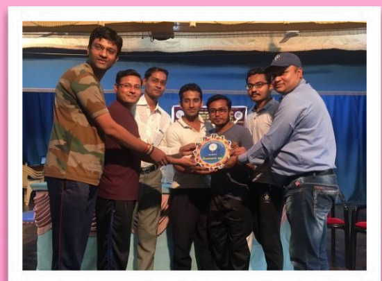
Students Winner @ Inter College Tournament