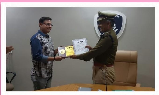
Alumni Awarded for Cop of the Month