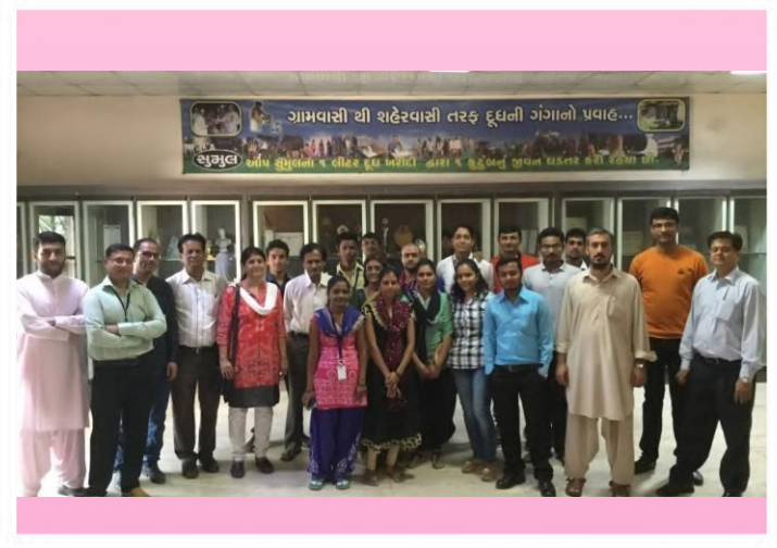
Visit to SUMUL Dairy Surat