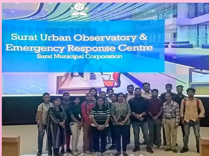
Visit to Surat Urban Observatory & Emergency Response Centre SMC