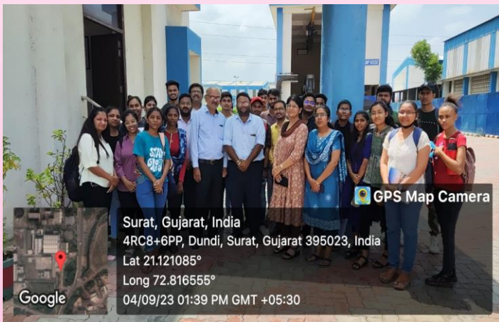
Visit to Waste Water Treatment Plant Bamroli