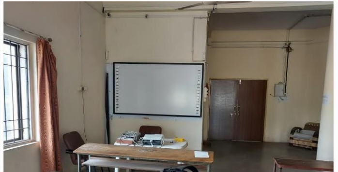
Classroom with Smart Board