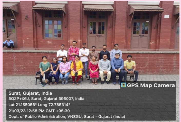
Visit to Surat Fort